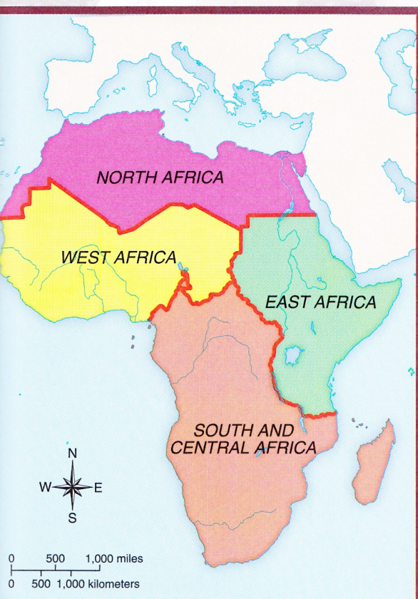
Regions of Africa

In this unit, you'll learn about the kingdoms and culture of West Africa. Let's begin our exploration by taking a closer look at how early societies developed in this region.